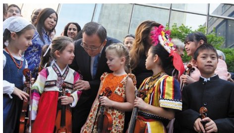
~Secretary-General Ban Ki-moon