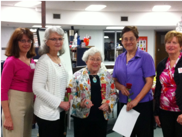
Mu Chapter initiates

We look forward to your energy and enthusiasm.