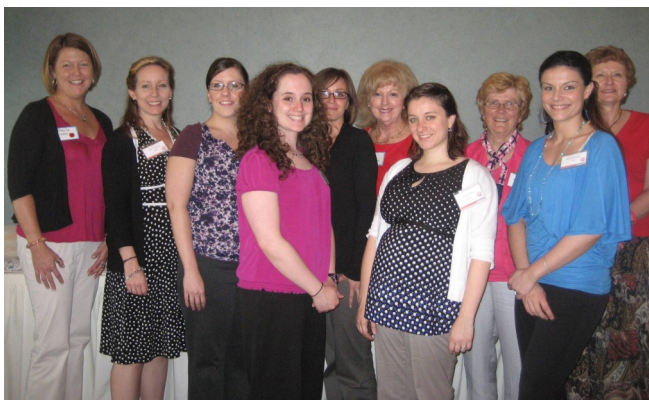
Delta Chapter 2011-2012 initiates